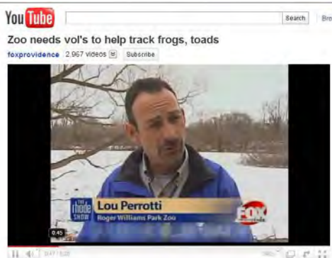
Roger Williams Park Zoo's FrogWatch USA Chapter was featured on the local news and is available on YouTube

Opening a FrogWatch USA Chapter contributes to amphibian conservation, links ex situ programs to in situ conservation, and promotes AZA-accredited zoos and aquariums within their local community. Chapters also support a national network of