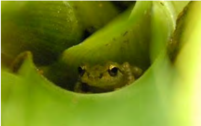
Eleutherodactylus caribe

2010 was significant year for ex situ amphibian conservation at the Philadelphia Zoo. In July, the Zoo received 22 Eleutherodactylus caribe from Haiti. This critically endangered frog is endemic to a very small area of the Tiburon Peninsula, in southwest Haiti. Not long after arrival in Philadelphia, the male frogs' whistle calls could be heard. The first evidence of successful reproduction was discovered in early September when an 1/8" froglet was discovered. The Zoo subsequently hatched out a total of 27 individuals successfully.