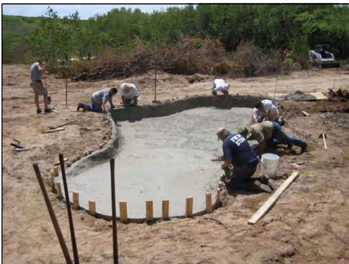
Fort Worth Zoo staff helping with pond construction

The pond was engineered to fill with water during the rainy, wet season, a prime breeding time for the toads, but only to hold enough water to allow the toads to lay eggs, hatch, and morph from tadpoles to toadlets before the water evaporates during the many dry periods that exist in this habitat. This design lessens the time period that the pond can be utilized for breeding by predators such as the invasive marine toad ( Rhinella marina ).